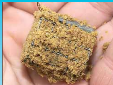
GROUNDBAIT FEEDER: An excellent attractor.

"there is plenty of swim choice because we only let 35 anglers on the lake per day"