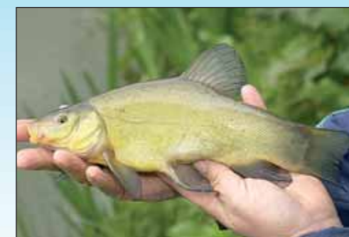
ON BOLINGEY: You'll find plenty of Tench.

For feeder work plug the feeder with a nice fishmeal type feed or small soaked pellets that can be squeezed together. Try and be accurate with your casting so that the rigs land fairly tight to the island or feature.